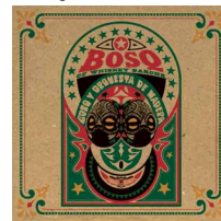
BOSQ BOSQ Y ORQUESTA DE MADERA CD/DLP