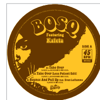
BOSQ FT. KALETA TAKE OVER 12