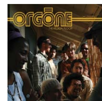
ORGONE THE KILLION FLOOR CD/DLP