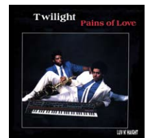
TWILIGHT PAINS OF LOVE CD/DLP