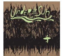
VARIOUS ARTISTS UNDER THE SUN SOUNDTRACK DCD/DLP