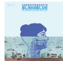
NOBODY PRESENTS BLANK BLUE WESTERN WATER MUSIC VOL.2 CD/DLP