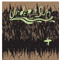
VARIOUS ARTISTS UNDER THE SUN SOUNDTRACK CD/DLP