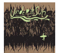
VARIOUS ARTISTS UNDER THE SUN SOUNDTRACK DCD/DLP

SALES: SCOTTY@UBIQUITYRECORDS.COM (949) 764-9012 ext.110 PRESS & PUBLICITY: MEZA@UBIQUITYRECORDS.COM (949) 764-9012 ext.109