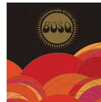
BOSQ CELESTIAL STRUT CD/LP