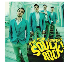
THE SOUL SURFERS SOUL ROCK! CD/LP