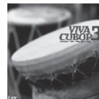
VARIOUS ARTISTS VIVA CUBOP 3 CD