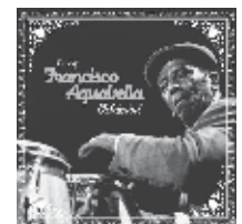
FRANCISCO AGUABELLA OCHIMINI CD