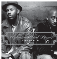
PPP TRIPLE P CD/DLP