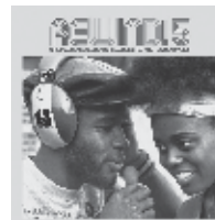
REWIND! 5 VARIOUS ARTISTS CD/DLP