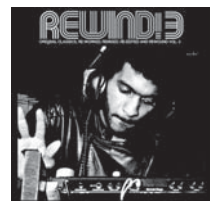
VARIOUS ARTISTS REWIND! 3 CD/DLP