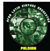
AFRO LATIN VINTAGE ORCH. PULSION CD/DLP/DIGITAL