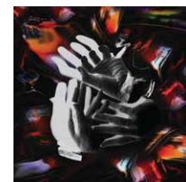
EVAN GEESMAN COILS LP/DIGITAL