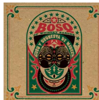
BOSQ BOSQ Y ORQUESTA DE MADERA CD/DLP