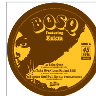
BOSQ FT. KALETA TAKE OVER 12