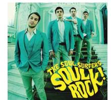
THE SOUL SURFERS SOUL ROCK! CD/LP