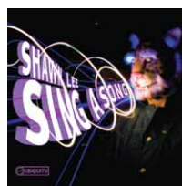
SHAWN LEE SING A SONG CD/DLP

SALES: SALES@UBIQUITYRECORDS.COM (949) 764-9012 ext.104 PRESS & PUBLICITY: MEZA@UBIQUITYRECORDS.COM (949) 764-9012 ext.109