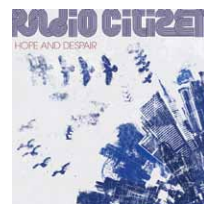
RADIO CITIZEN HOPE AND DESPAIR CD/DLP