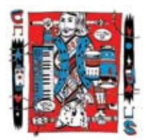
SHAWN LEE & CLUTCH HOPKINS CLUTCH OF THE TIGER CD/DLP

SALES: SCOTTY@UBIQUITYRECORDS.COM (949) 764-9012 ext.110