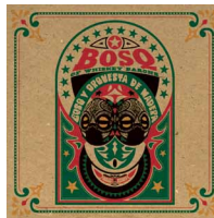
BOSQ BOSQ Y ORQUESTA DE MADERA CD/DLP