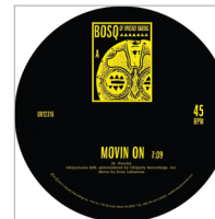
BOSQ MOVIN ON 12